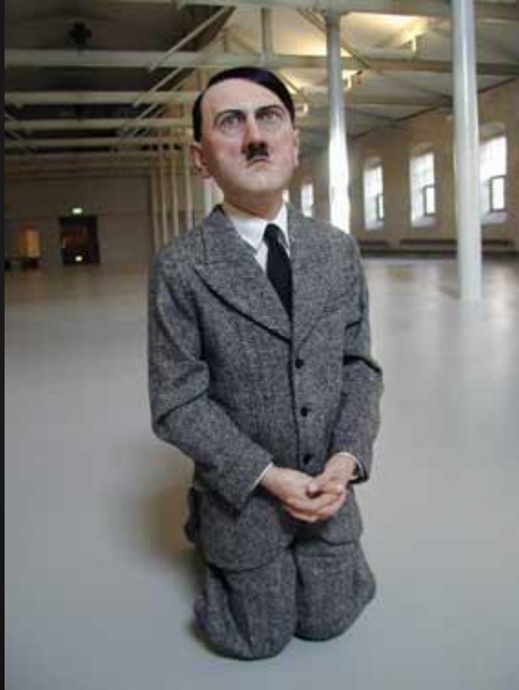
Him, Maurizio Cattelan, Wax, 2001