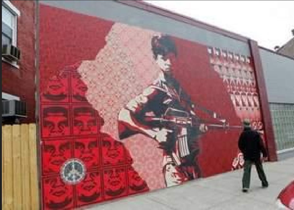
Shepard Fairey, The Duality of Human 4 Pike Street Mural, 2010