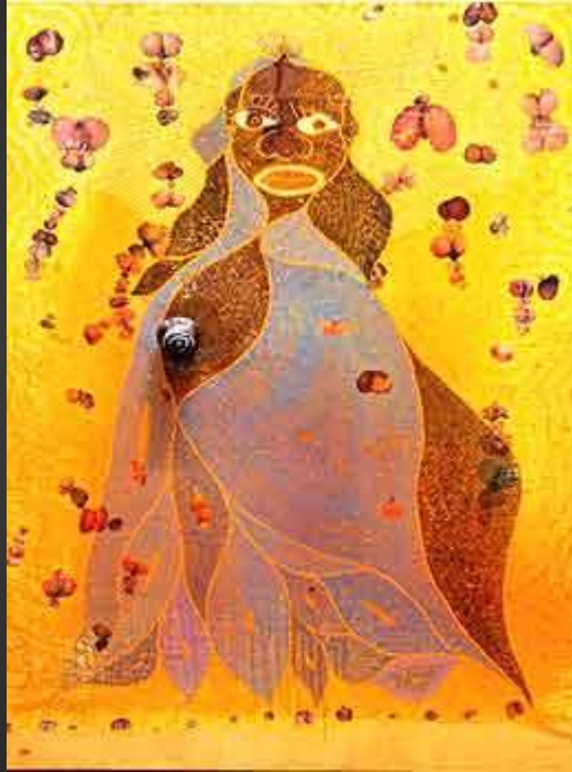
The Holy Virgin Mary, Chris Ofili, Mixed Media, 1996