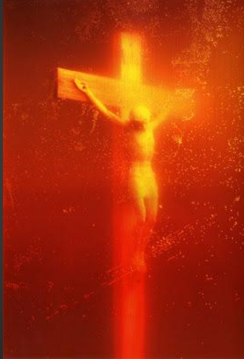
Piss Christ by Andres Serrano, Photograph, 1987