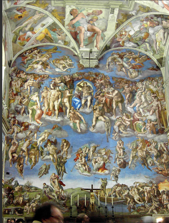
The Last Judgement, Michelangelo, fresco, 1536-1541